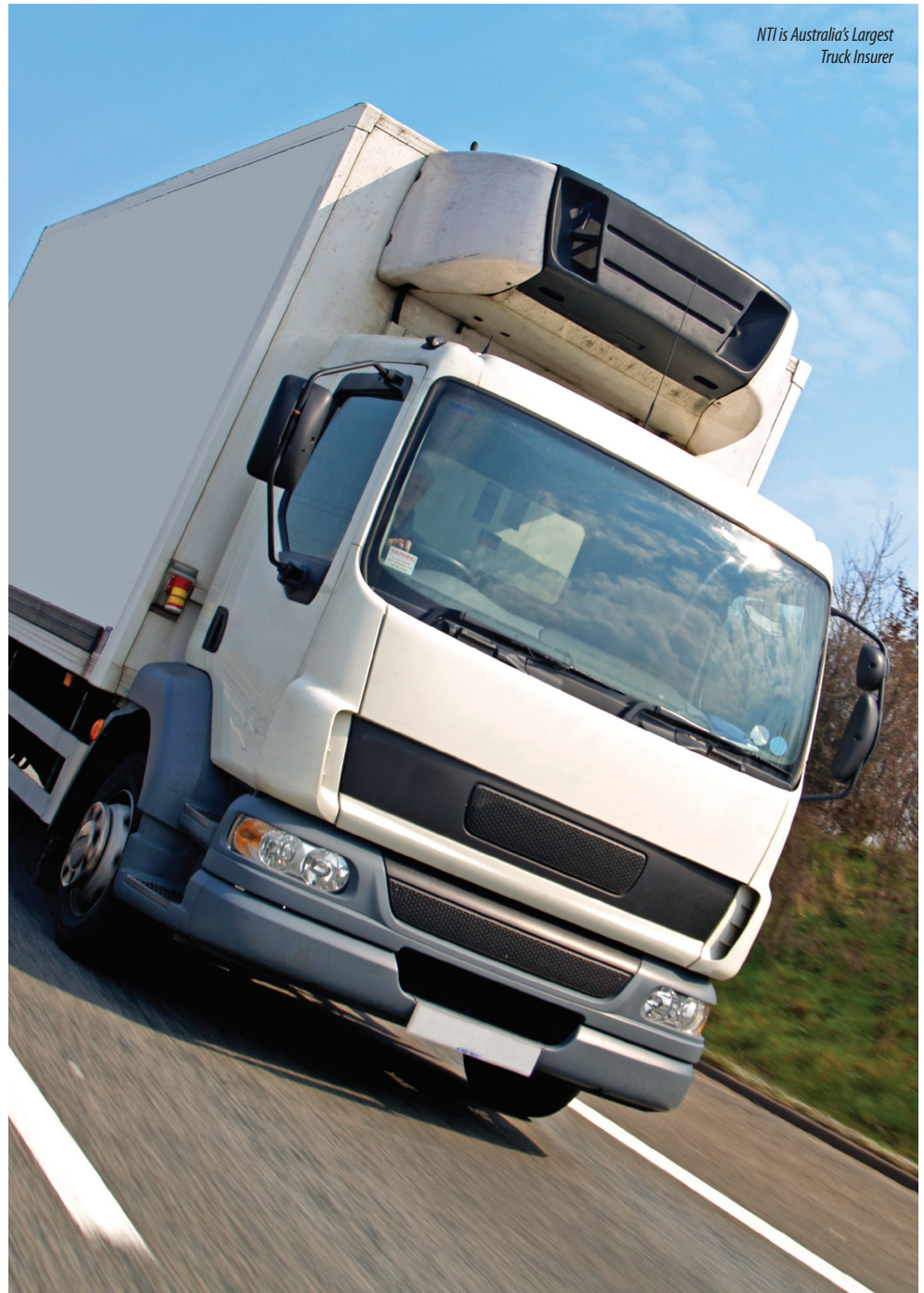
NTI is Australia's Largest Truck Insurer

Prepared to look offshore, NTI chose Auckland based RHE & Associates whose speciality is the development of leading edge